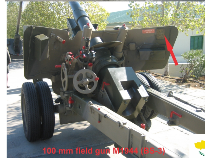
100 mm field gun M1944 (BS-3)