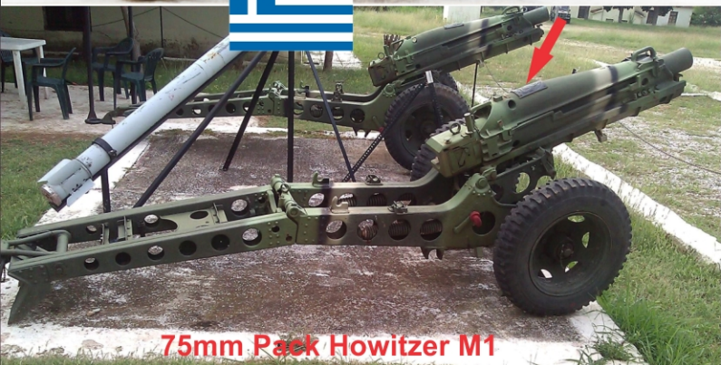
75mm Pack Howitzer M1