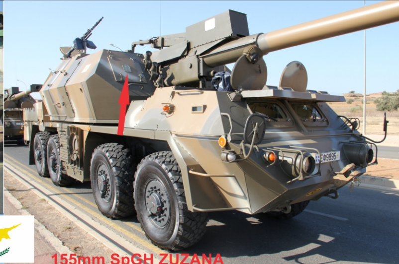
155mm SpGH ZUZANA