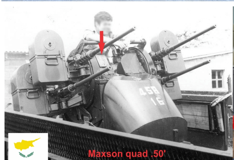
Maxson quad .50'